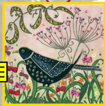
ELH1 16 x 16 cm (6" x 6") Blackbird