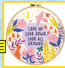
ELFW3 20 x 20 cm (8" x 8") Look Up