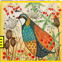
ELH3 16 x 16 cm (6" x 6") Partridge