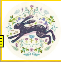
EKP2 20 x 20 cm (8" x 8") Folk Hare