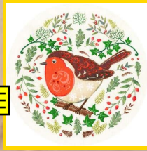
EKP3 20 x 20 cm (8" x 8") Folk Robin