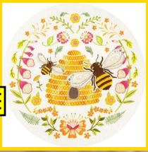
EKP1 20 x 20 cm (8" x 8") Folk Bees