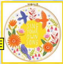
ELFW1 20 x 20 cm (8" x 8") Sing