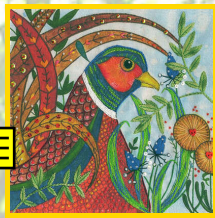
ELH2 16 x 16 cm (6" x 6") Pheasant