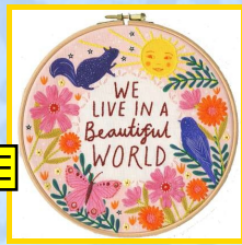
ELFW2 20 x 20 cm (8" x 8") Beautiful World